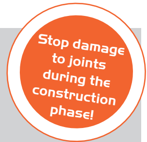
Joint damage during construction

Black (Standard), Grey, Blue, Red, Yellow. (On Request)